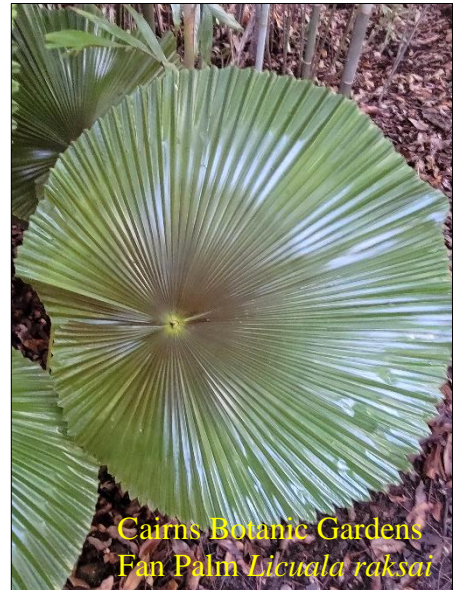
Cairns Botanic Gardens Fan Palm Licuala raksai