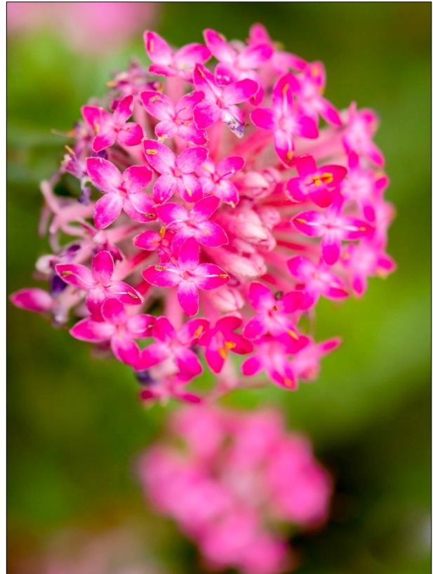
Pimelea ‘Magenta Mist’ growing in a Ballarat garden.